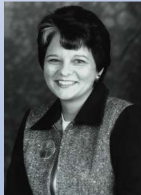
Professor, American Indian Studies