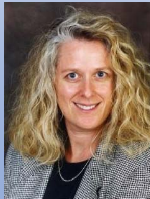
Professor, Soil, Water & Environmental Science