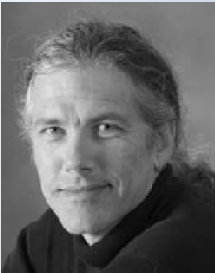
Distinguished Professor, Psychology